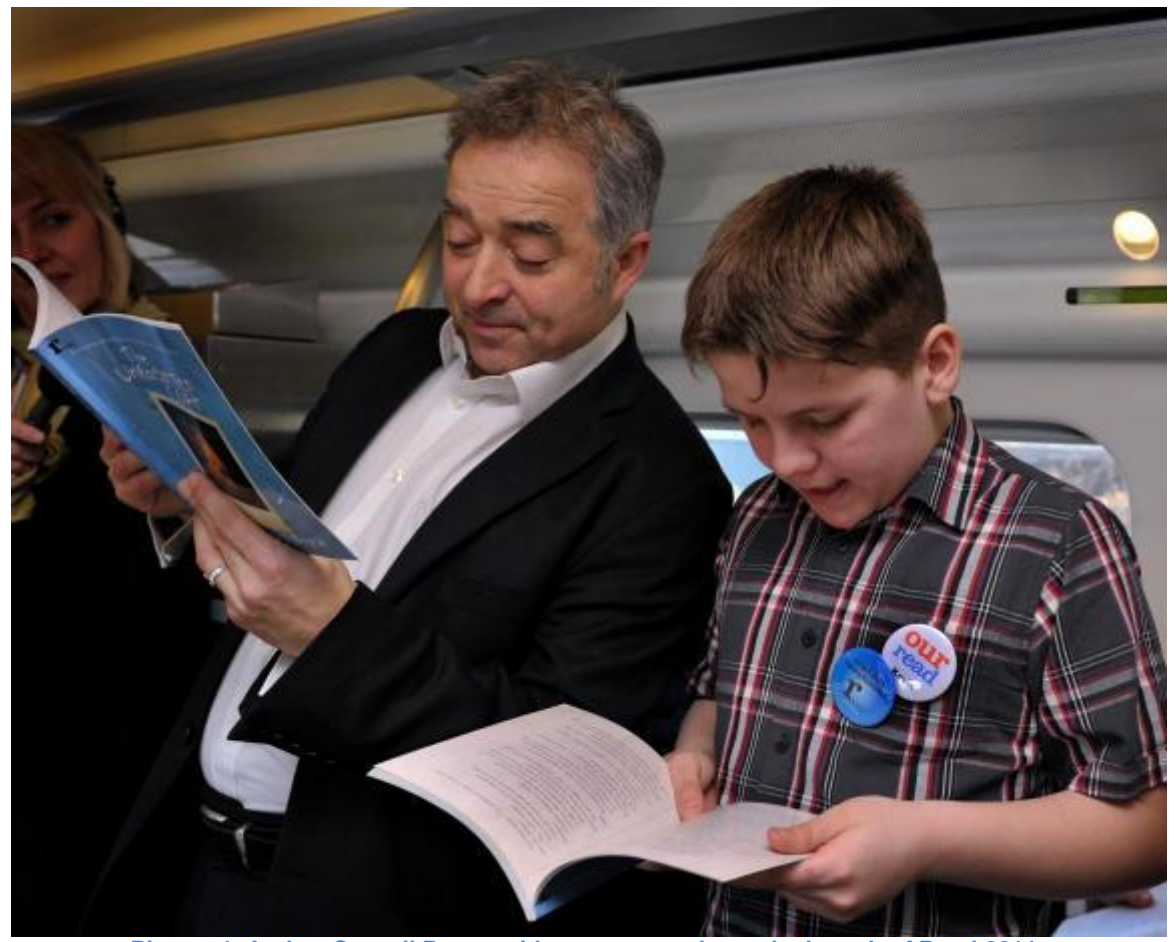
Picture 4: Author Cottrell Boyce with a young reader at the launch of Read 2011

Children were also given the opportunity to meet new people and to participate in a number of Get into Reading social events. For example, a number of children travelled to London with TRO patron, author Frank Cottrell Boyce, to promote his book, The Unforgotten Coat and to launch Our Read 2011, an initiative to give away 50,000 books to children (picture 4). Written especially for TRO, the book was launched during a 'chain' reading session on a train with the author, and was something that all child interviewees had been involved in. They reported feeling especially proud at having met an award-winning author and at being given the opportunity to be involved in the initiative.