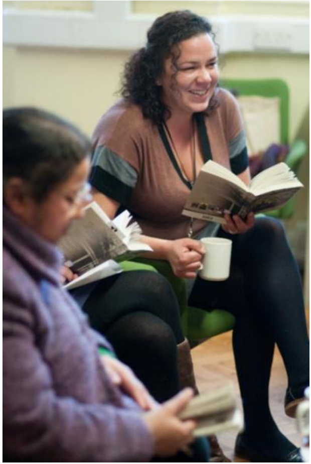
Picture 2: Get into Reading project worker leading a Get into Reading session