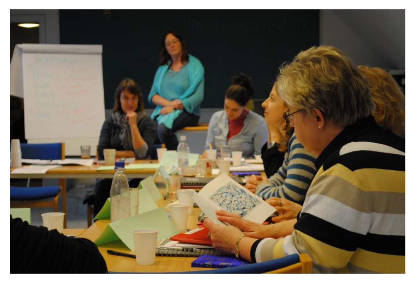
Picture 6: Read to Lead training session for Get into Reading facilitators

The nature of the SROI evaluation in attempting to quantify the unquantifiable (for example, the value of self-confidence for an individual, or for improved or increased friendships) is that it was often quite difficult to elicit meaningful financial outcomes from participants. The SROI analysis itself is dependent on the responses given by the research participants, which are subjective to that group at that particular time-point. On a number of occasions where group members were not able to arrive at financial amounts themselves, financial proxies were derived at using known proxies used elsewhere in other research or from examples given during qualitative data collection (e.g. cost of a mentoring course, or NVQ course). While the numbers involved in the research were quite small, these were a good representation of the groups involved. For example, the Wallasey Library open group has up to twelve group attendees a week and there are upwards of ten who attend the Arch recovery group. While individual participants have different experiences, they did share many of the same outcomes and their responses to financial valuing of this were quite similar.