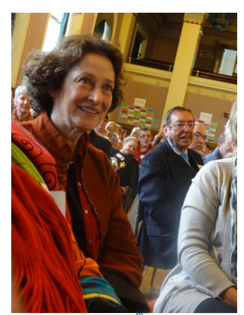
Picture 7: An audience at The Reader Organisation's 10<sup>th</sup> celebration conference, September 2012.