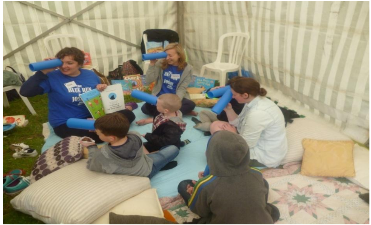
Figure 5: A children's reading session as part of Everton Park's Out of the Blue music festival.

Many group attendees reported learning new personal skills such as confidence, self-esteem, empathy and better acceptance of other people's opinions. This had made them feel better empowered, but it also had the effect of facilitating an improved social life, both during Get into Reading Sessions, and afterwards. Get into reading sessions had resulted in a great many achievements, from routine, order and purpose to pride and a sense of reciprocity. Many attendees had gained so much from the sessions that they had actively gone out of their way to train and attend more sessions and to volunteer so that they could in turn give something back to their community. An example of this is the annual Out of the Blue music festival in Everton Park, where staff and volunteers delivered reading sessions to young children attending (picture 4).