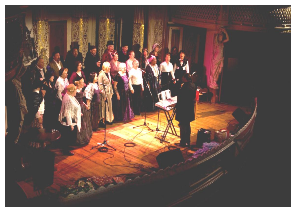
Picture 3: The Liverpool Harmony choir at one of The Reader Organisation's Penny Reading events

The friendships, relationships and routine borne out of regular attendance at the reading sessions meant that attendees' confidence levels had increased, which had enabled them to want to try new things. As a direct result of the friends they made in the reading sessions, many maintained these friendships outside of the groups, organising and participating in many social events, some organised by The Reader Organisation such as 'Penny Readings' and trips to watch Shakespearean plays, while others took up line dancing and visits to the cinema.