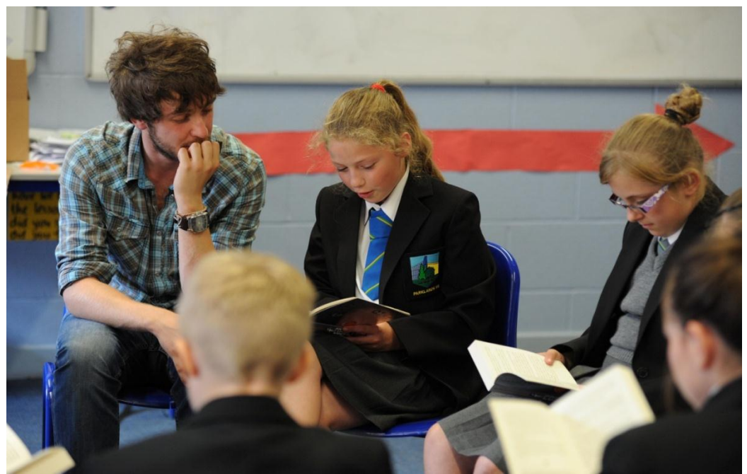
Picture 6: Get into Reading sessions among secondary school children

The sessions have also led to fun opportunities to make reading more amenable, with visits to libraries, organised trips and opportunities to meet with authors. TRO also donated books to children that they were able to keep.