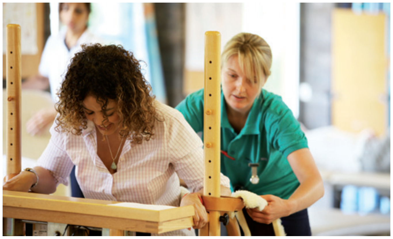
Central Surrey Health provide a wide range of nursing and therapy services