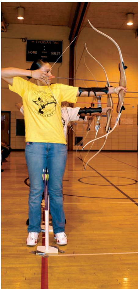
High school students practice archery at a Children’s Aid Society after-school program.