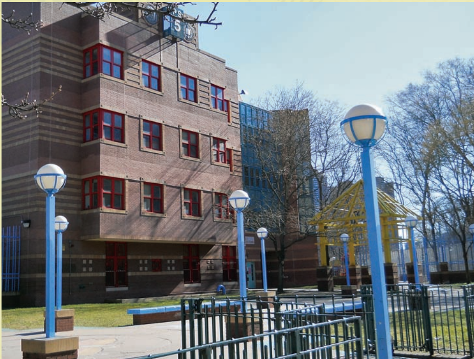
P.S. 5 in Washington Heights, New York City, a Children's Aid Society community school.

Availability of data: Ongoing in-house data collection process. New York City Education Department data for 2007 to 2008 is available.