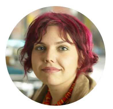
"My case was raised not just for myself but for other young people in the LA. The treatment I received from LA was in my view appalling. Voice and [my advocate] provided the catalyst to get my views heard and my outcomes achieved. Thanks!"