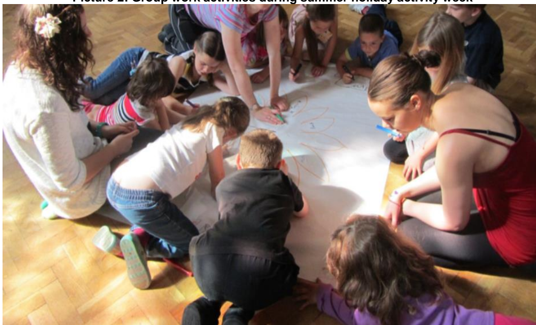
Picture 2: Group work activities during summer holiday activity week

To further support families, over the twelve-month period of study, a total of 212 food hampers were distributed including 50 at the start of the summer holidays and 30 at Christmas (donated by Life Church and Wirral Lions). Six families also benefited from pre-paid gas and electricity cards and a gift of coal that was given by Ferries Family Groups.